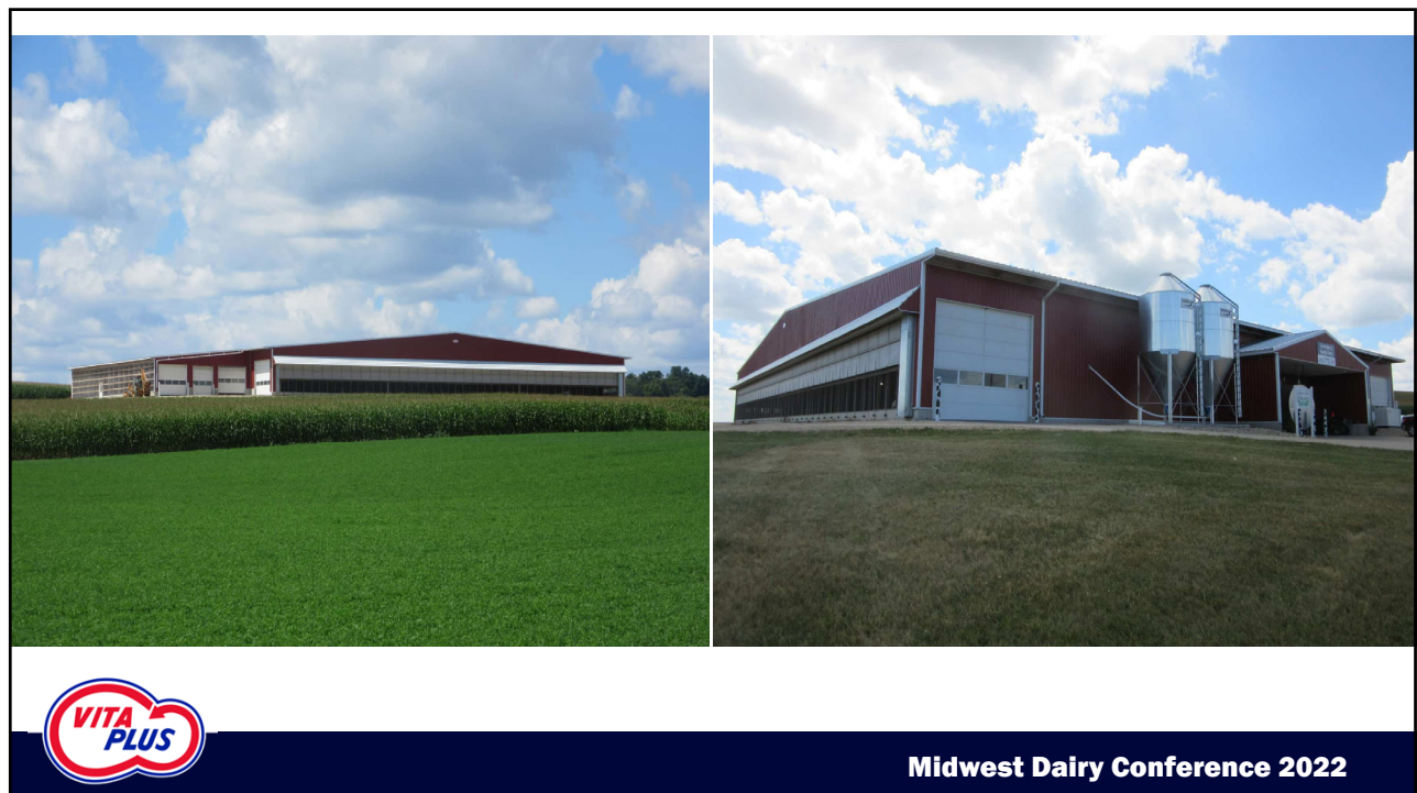
Midwest Dairy Conference 2022